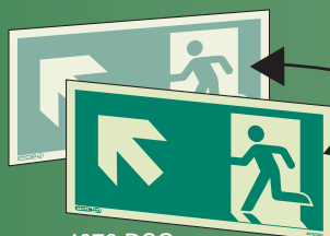
4978 DSG 4978 DSI, 4978 DSW