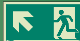
4978 G 4978 L, 4978 I, 4978 W