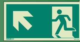
4978 FSG 4978 FSI