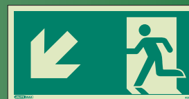
4980 G 4980 L, 4980 I, 4980 W