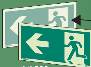
4343 DSG 4343 DSI, 4343 DSW

To order a hanging kit, quote: zhooks/clips