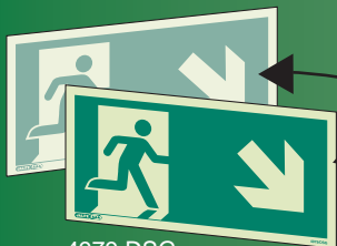
4979 DSG, 4979 DSI, 4979 DSW