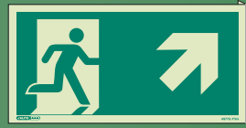
4977 FSG 4977 FSI