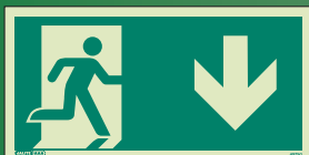
4975 G 4975 L, 4975 I, 4975 W