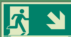
4979 G 4979 L, 4979 I, 4979 W