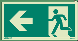
4343 FSG 4343 FSI